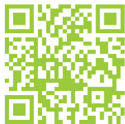
Exhibit closes Thursday, May 30

Shining STAR Qualities: Being a leader, helper and great teammate