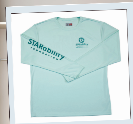
UV performance tees!

Mary Poppins @ Broadway Palm Details to follow!