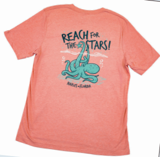
Custom graphic tees!